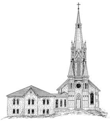
St. Mary of the Assumption Owen Sound

Email: smm@bmts.com www.stmarysandthemissions.ca